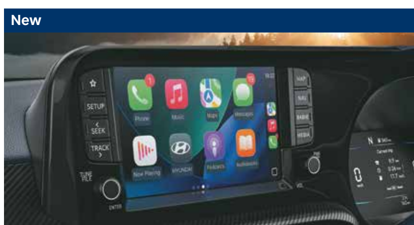
New Wireless Android Auto & Apple CarPlay*