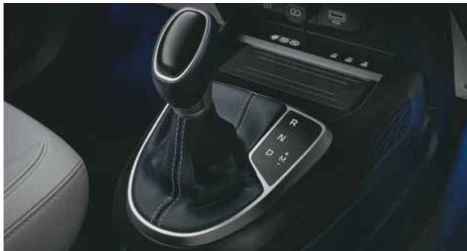
Automated manual transmission (AMT)