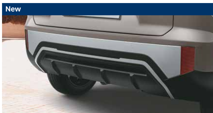
New Bold rear bumper & skid plate