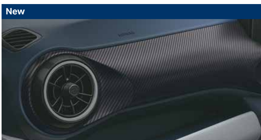
New 3D Carbon-Pattern dashboard finish

Step in, settle down, and let the outside world fade. Where thoughtful design meets everyday comfort, and every journey feels warmer, calmer and more yours.