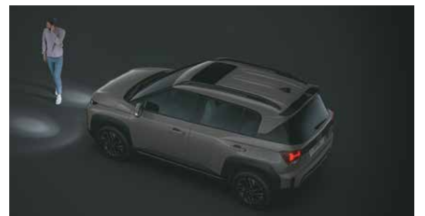
Headlamp escort function