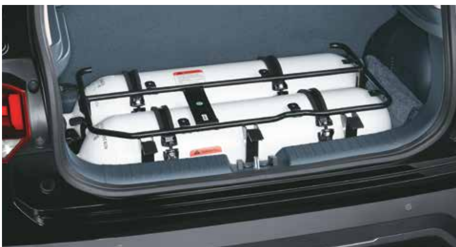
Company fitted dual cylinder CNG

Maximum torque 95.2 Nm (9.7 kgm) @ 4 000 r/min