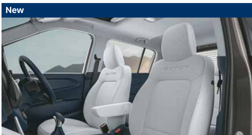
New Semi fabric seat upholstery with EXTER branding