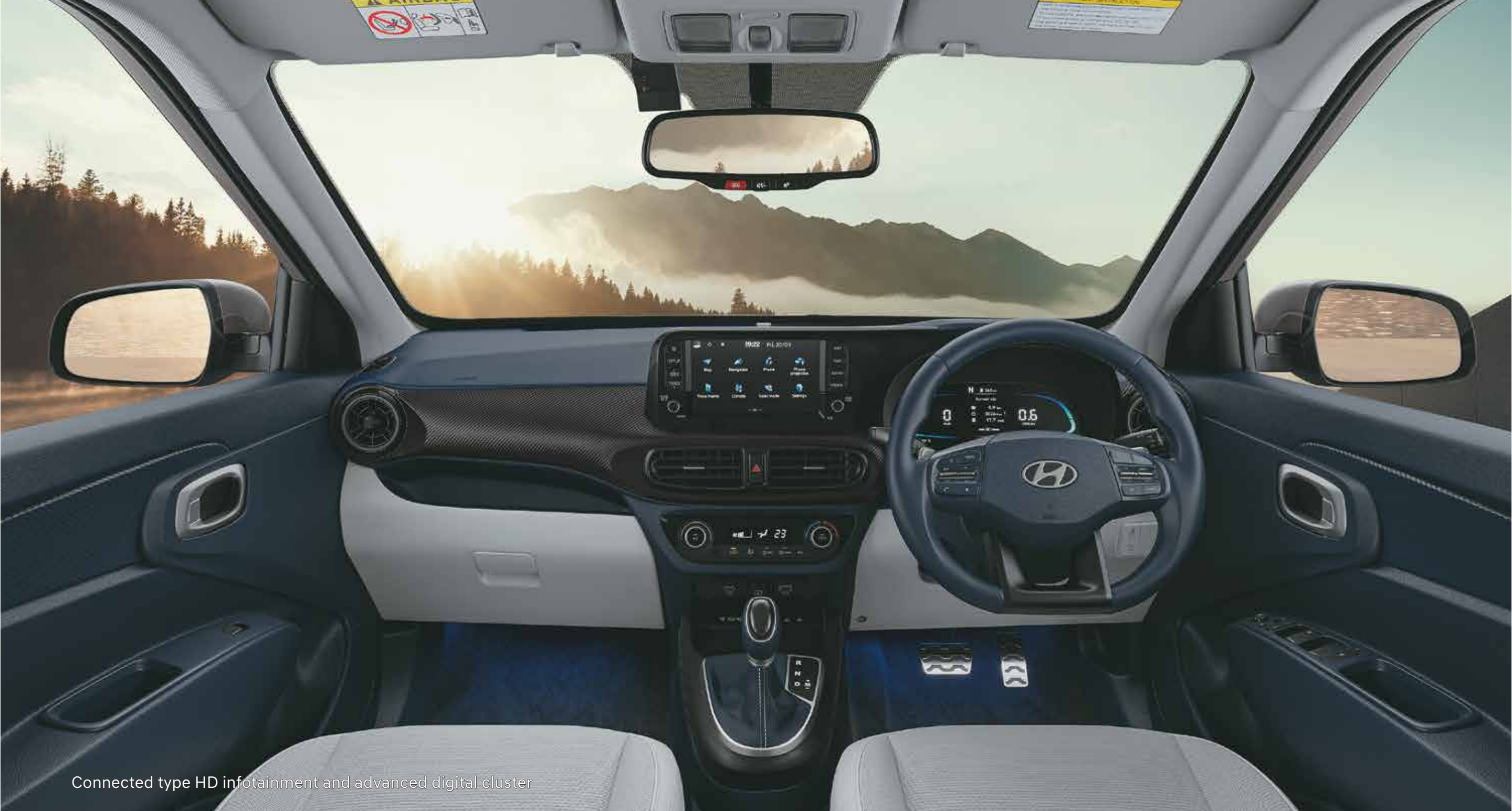
Connected type HD infotainment and advanced digital cluster