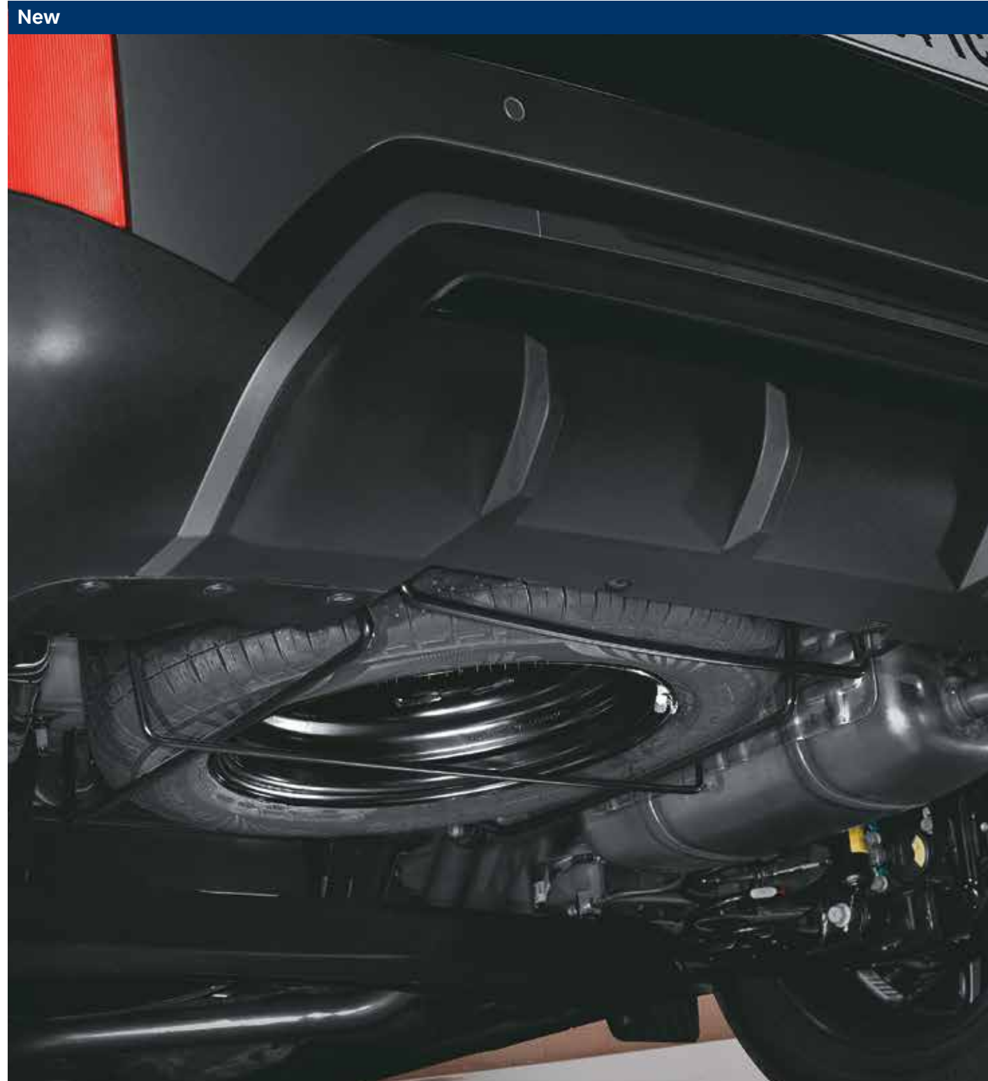
Underbody mounted spare wheel