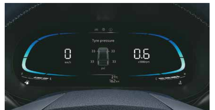
Tyre Pressure Monitoring System (TPMS) – Highline

Other features: Emergency stop signal (ESS) | Day & Night IRVM with MTS | Front disc brakes | Seatbelt reminder (All seats) | 3 point seatbelt (All seats)