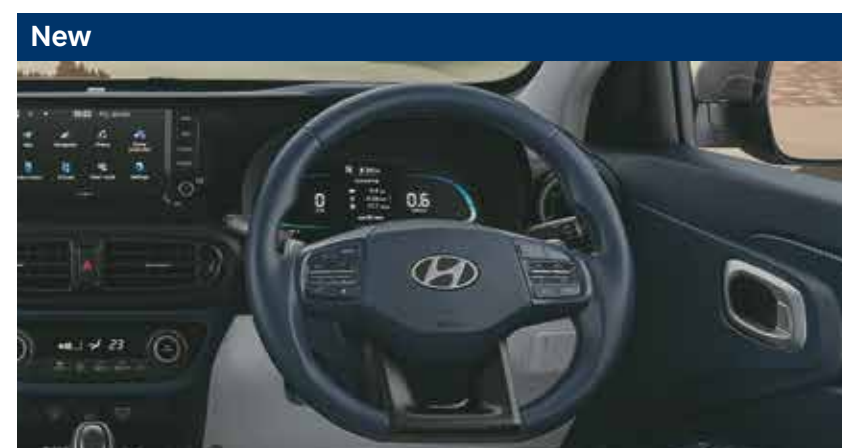
New D-Cut steering wheel