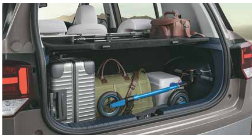
Spacious boot space of 391 l ^