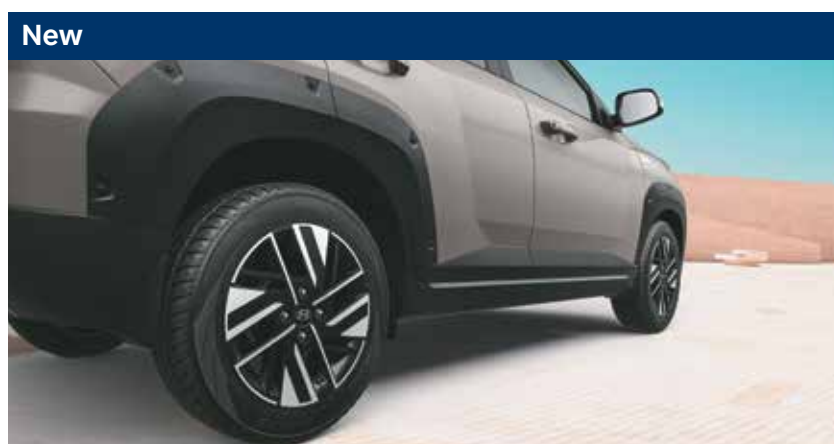
New R15 (D = 380.2 mm) Diamond cut alloys & wheel arch cladding (add-on)