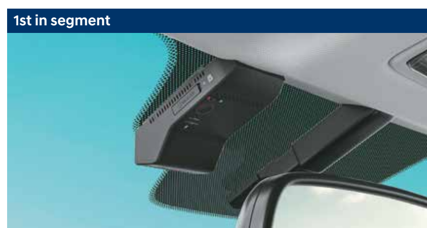
1st in segment Dashcam

When technology takes the lead, every moment becomes yours. To enjoy the drive. To enjoy the company. To enjoy life as it happens.