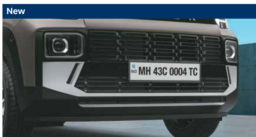
New Bold front bumper | Black radiator grille

Every line, every detail is designed to stand out. So, wherever the road takes you, the new Hyundai EXTER makes sure you arrive shining a little brighter.