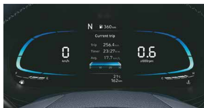
Digital cluster with colour TFT MID