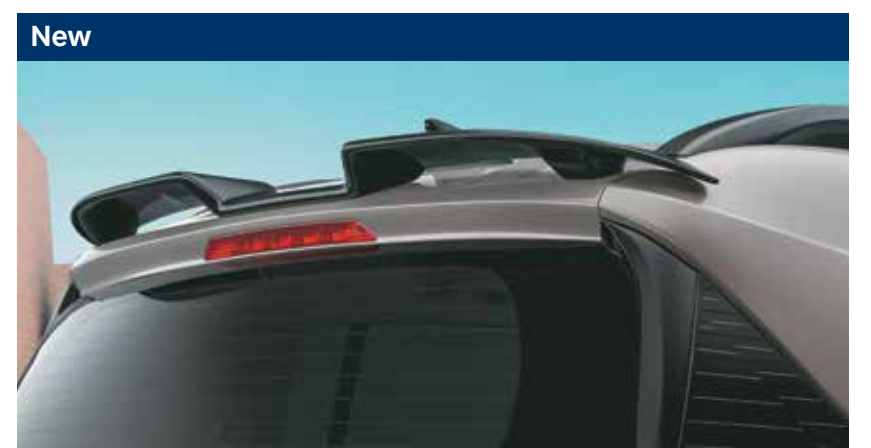
New Wing type spoiler