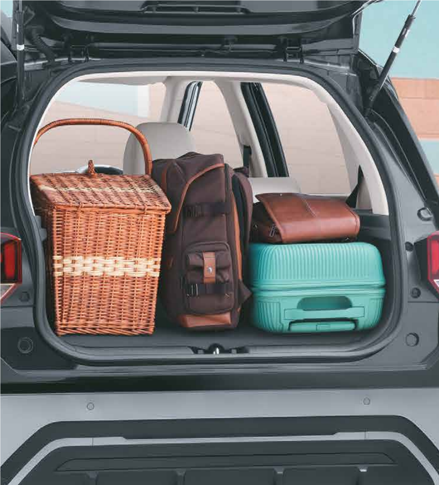
Ample CNG boot space of 225 l ^