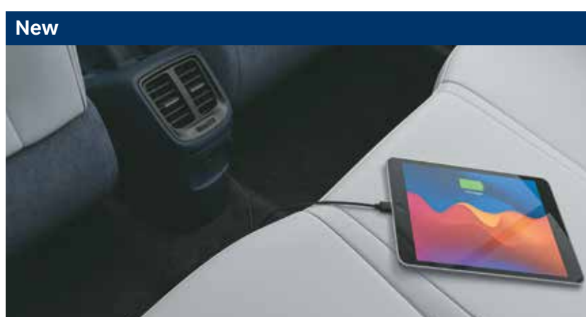
New Rear C-Type USB charger