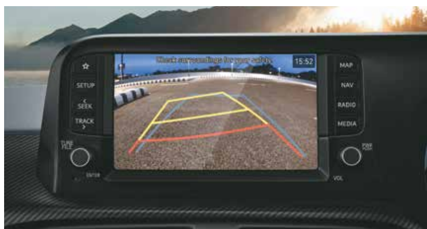
Rear parking camera