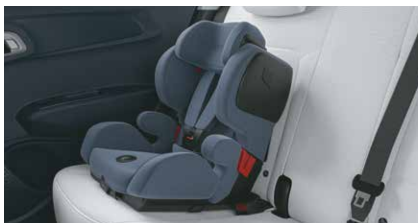
Child seat anchor (ISOFIX)