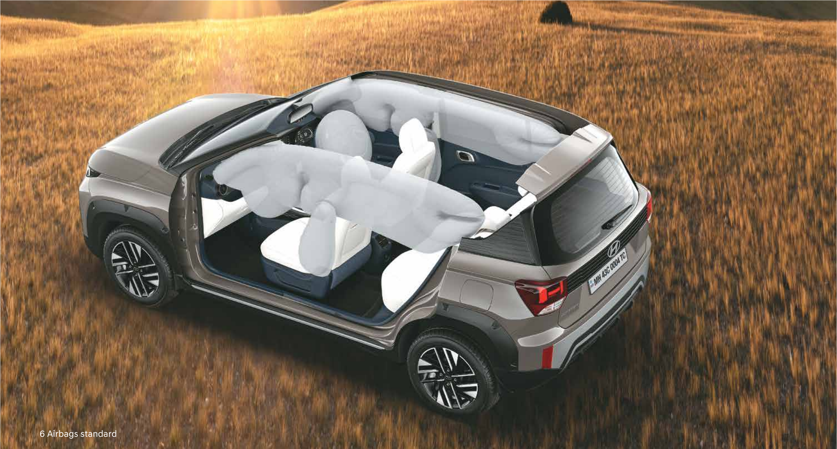
6 Airbags standard