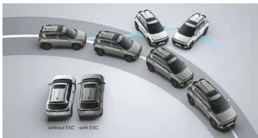
Electronic stability control (ESC)