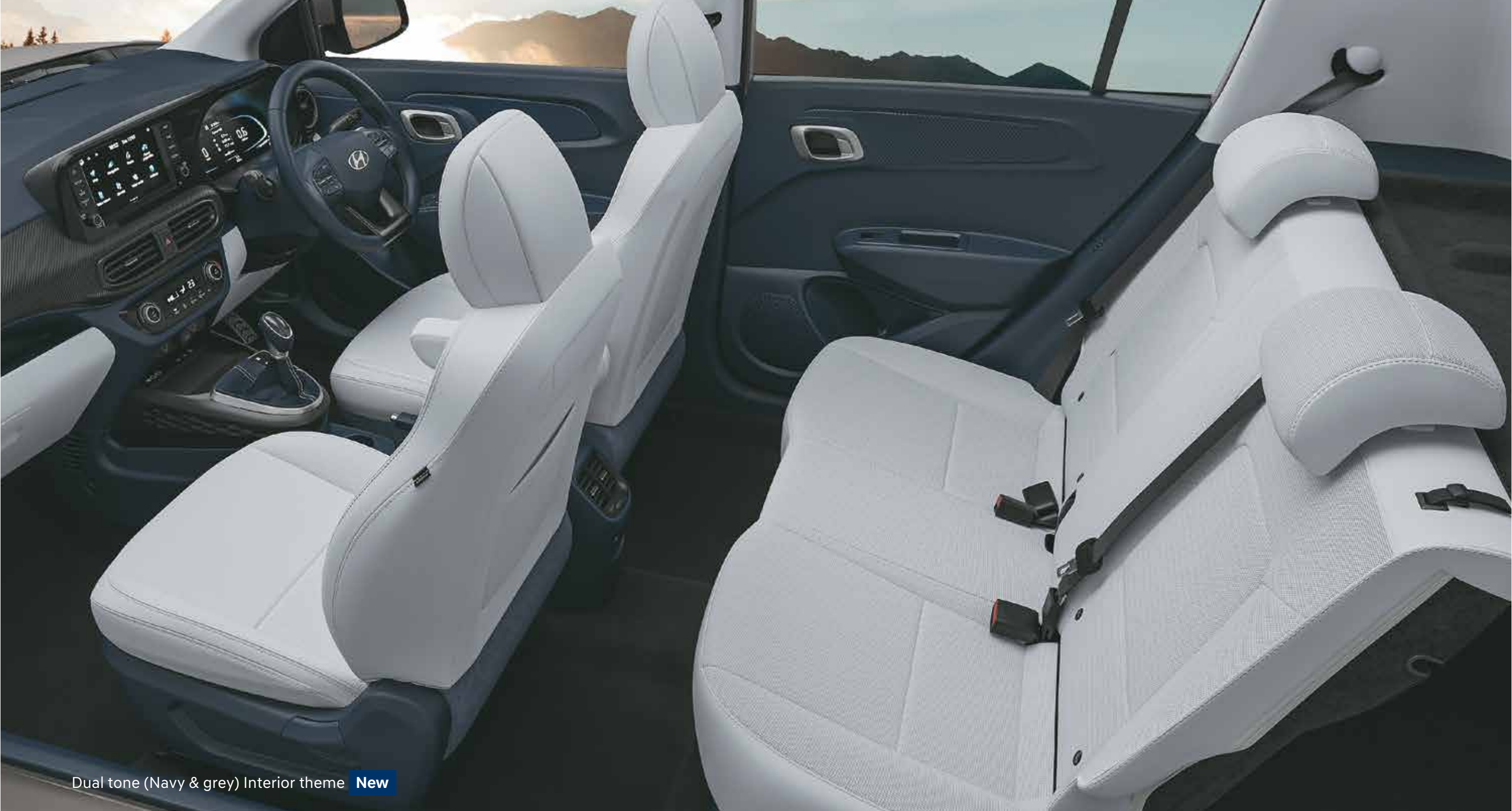
Dual tone (Navy & grey) Interior theme New