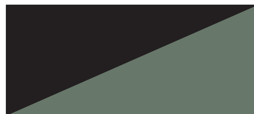
Ranger khaki with black roof