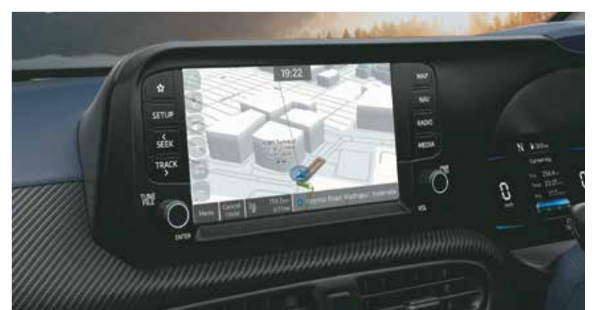
20.32 cm (8") HD audio video navigation system