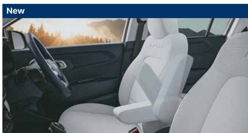
New Folding driver armrest