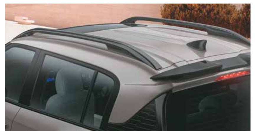
Bridge type roof rails & shark fin antenna

Other features: LED tail lamps | C-pillar garnish | Tailgate garnish | Side sill silver garnish