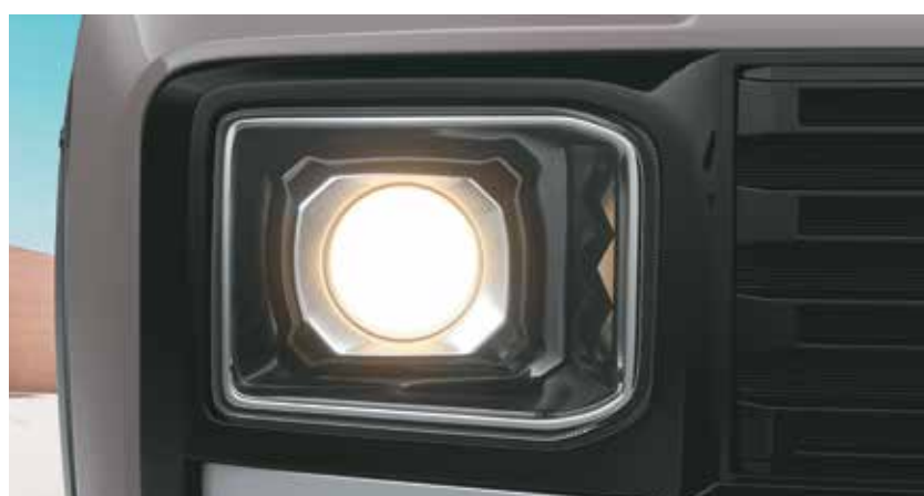
Projector headlamps (Bi-function)