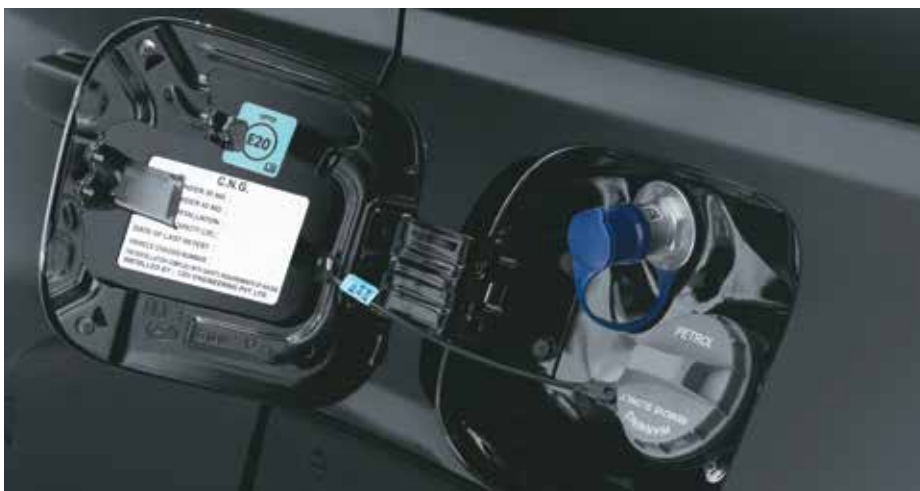
Convenient CNG filling with fast refuelling nozzle (near petrol filling area)