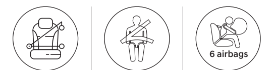
Standard across all variants

30 Standard safety features More than 45 advanced safety features